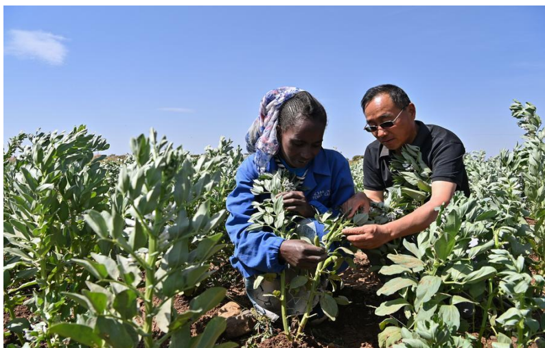
A Chinese legume crop expert instructs a local farmer on field management of broad beans at a demonstration orchard of agricultural technical assistance, in Asmara, Eritrea, Sept. 27, 2023.

a crucial crossroads, and China-Africa cooperation and development are facing more uncertainty. China's answer to the question of "where is human society headed and how can China-Africa cooperation develop" is to build a closer China-Africa community with a shared future. This is the trend of the times and the common voice of the people of China and Africa.